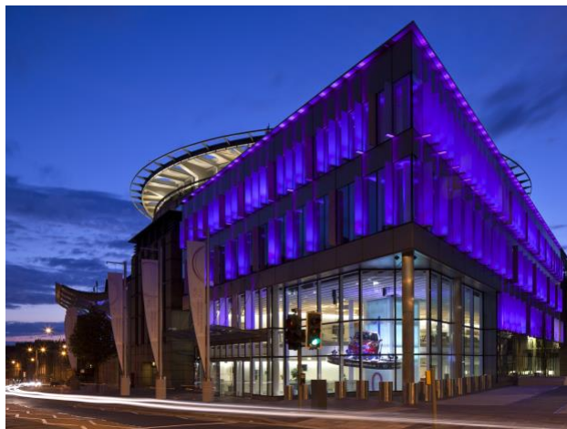
Edinburgh International Conference Centre

Invited speakers across plenary, parallel and keynote sessions will represent the leading individuals and labs active in the field today. Our congresses have become known for their cutting-edge science, up-to-date programming, student engagement activities, and their focus on enabling in-depth networking and collaborations across our exhibition, fully catered opening and closing events, coffee and lunch breaks, poster sessions and the famed Molecular Mingle. In Edinburgh, this will take place at the National Museum of Scotland where we will open some of the galleries for exploring and will showcase the best of local cuisine and entertainment.